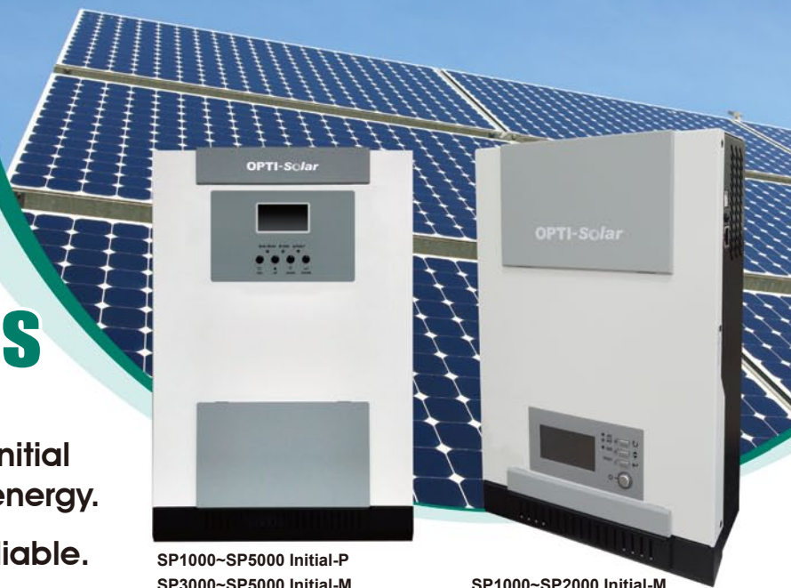
SP1000~SP5000 Initial-P SP3000~SP5000 Initial-M

Specifications are subject to change without notice.